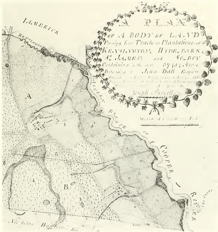
Plat of Hyde Park, Kensington . . . by Joseph Purcell; ink and watercolor on paper; Charleston, S.C.; 1788. HOA 24 1/2"; WOA 40". MESDA acc. 4490.1.